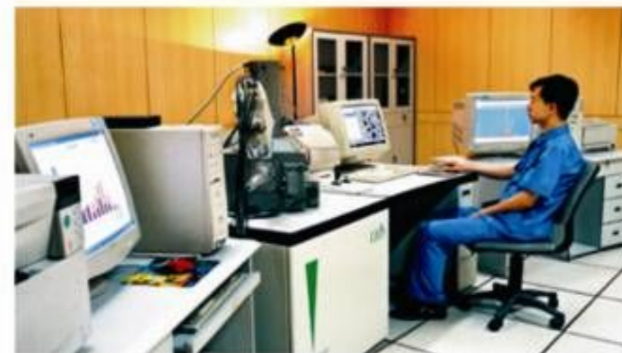
扫描电镜 Scanning Electron Microscope