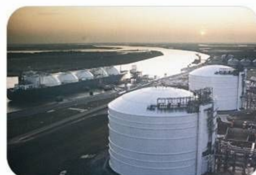
大型LNG储罐 Large LNG tanks