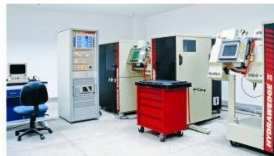
热模拟试验机 Thermal Simulating Tester