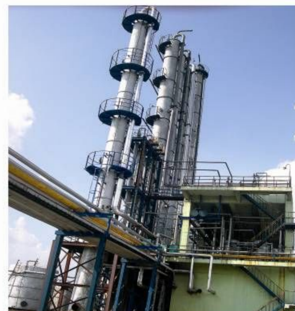
炼油蒸馏装置 Refining and distilling equipment