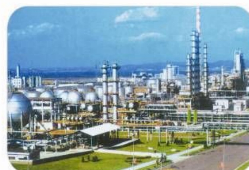
化工厂 Chemical plant