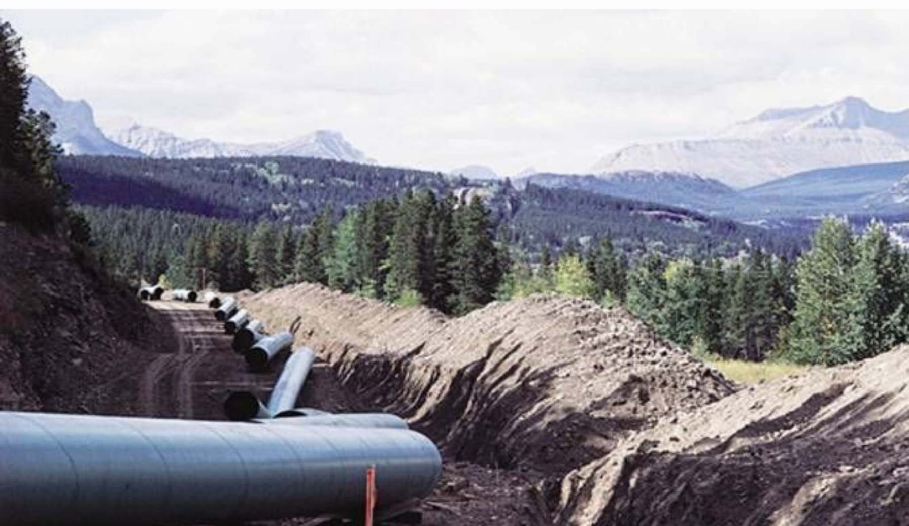
西气东输二线 Two pipelines from the west to the east

◆ Till now we have already supply 480,000tons X80 pipeline steel. The first spiral welding pipe of West-East natural gas transmission project also come from TISCO. We have do some contribution to national energy construction and also to the blank of domestic high grade X80 pipeline steel.