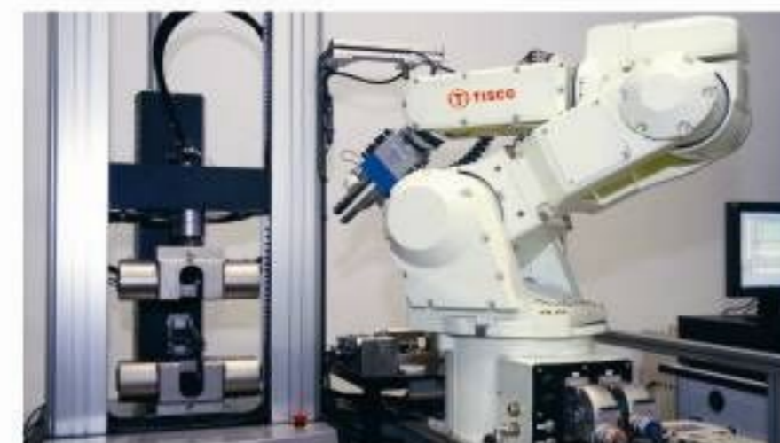
全自动电子拉伸试验机 Automatic electronic tensile tester