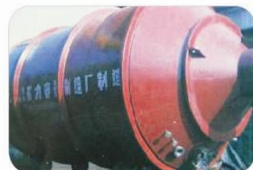
制盐主体设备——蒸发罐 Salt making main equipment——evaporating pot