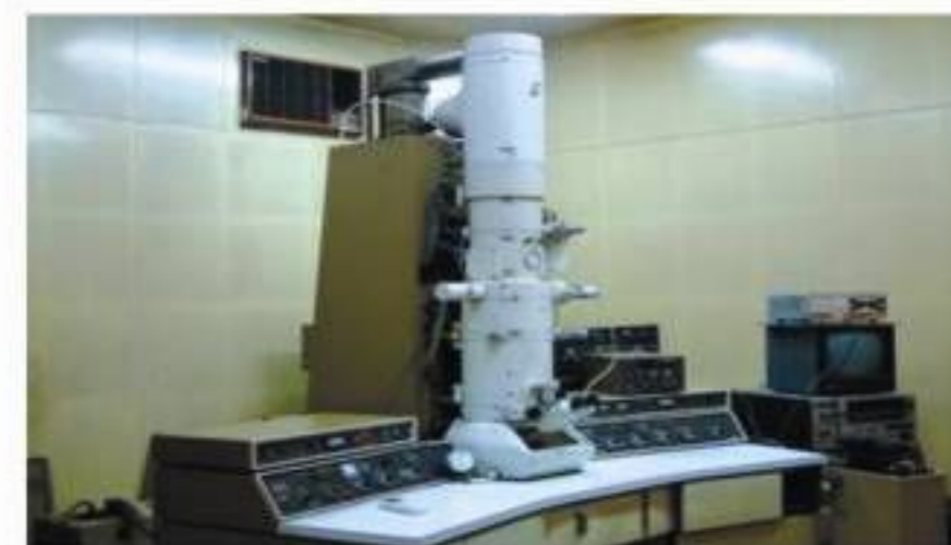
透射电镜 Transition Electron Microscope