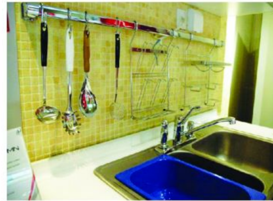
厨房用具 Kitchen appliances