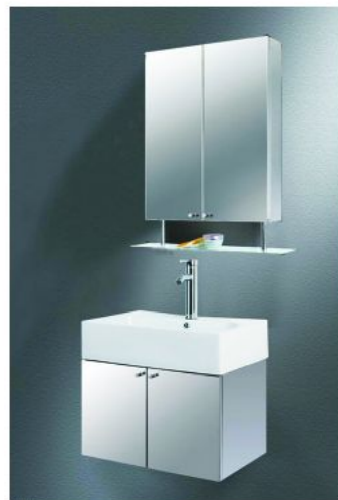
卫浴 Bathroom articles