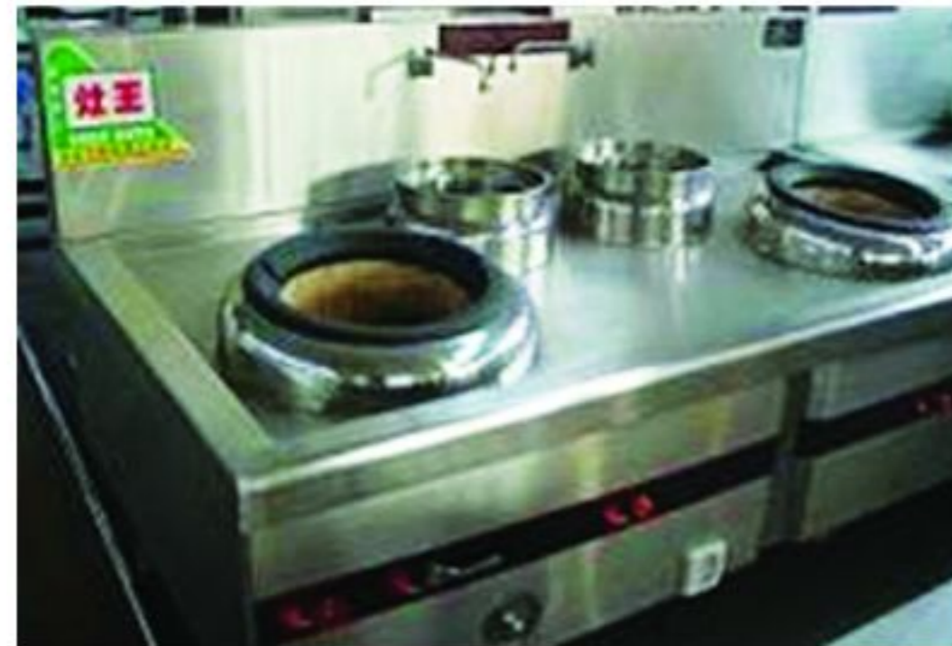
430冷板 430 Cold rolled strips

制品行业用钢广泛应用于日用五金、厨房用品、家电材料、医疗器械等。 Following products are widely used in daily hardware, kitchen appliance, household appliances and medical instruments.