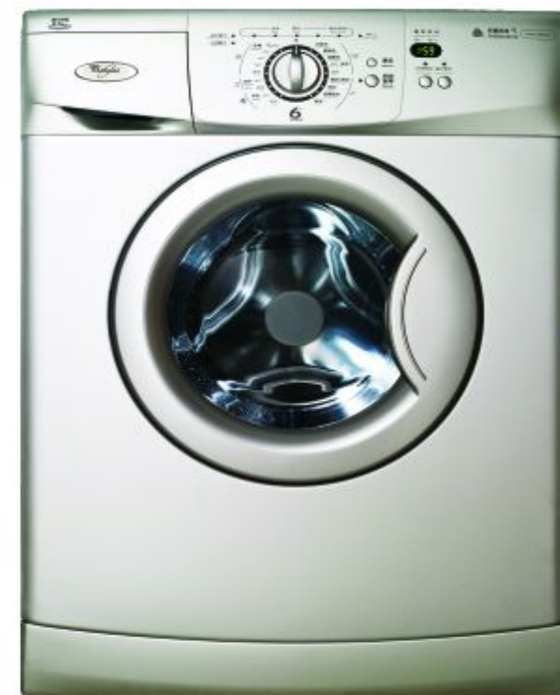
洗衣机 Washing machines