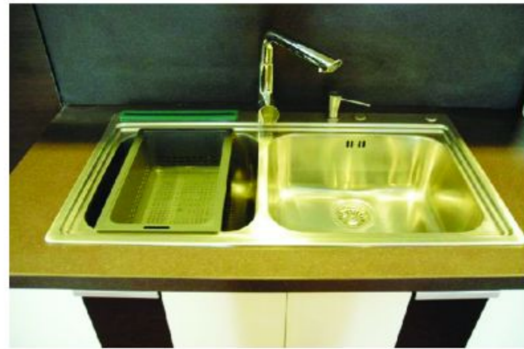
不锈钢水槽 Stainless steel water sinks