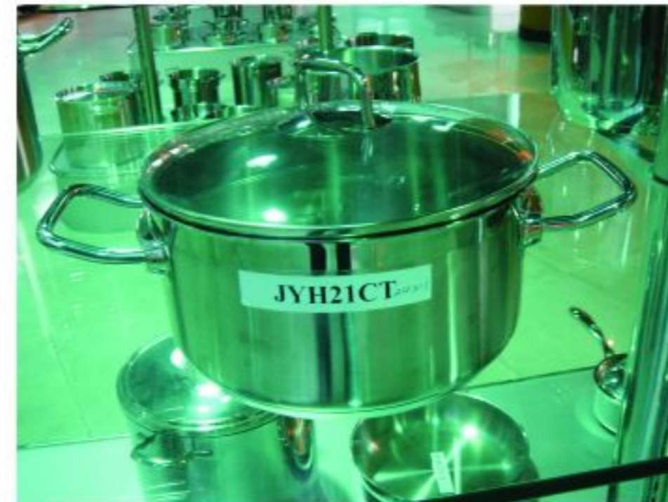
443冷板 443 Cold rolled strips